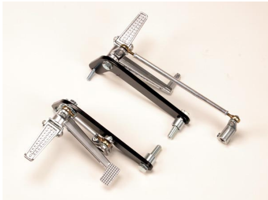
Kawasaki W650 1999-