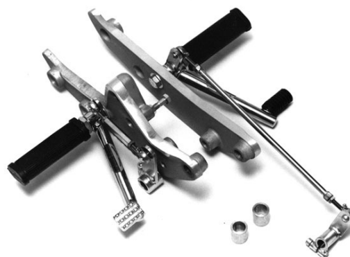
Honda 750F, 900F, 1100F