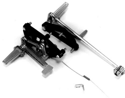
Suzuki GSF 600 BANDIT 1995