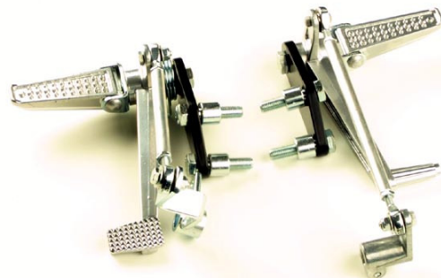
Triumph Bonneville, 2001